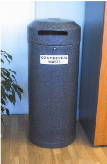
MI4 Continental Confi Bin – 52L Polyethylene body & galvanised steel liner