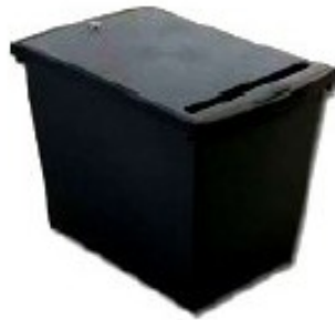
Personal Security Container – 34L designed for under-desk