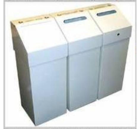
Zintec-SQ Confidential Bin – 60L Made from fire-resistant Zintec steel