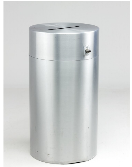
New Brussels Confidential Bin – 87L Made from brushed and lacquered aluminium