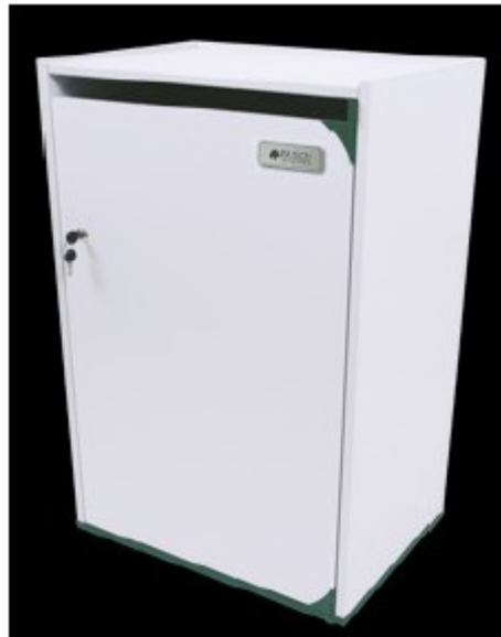
Duraflex Confi Cabinet – 40L Polyethylene with 25% recycled content