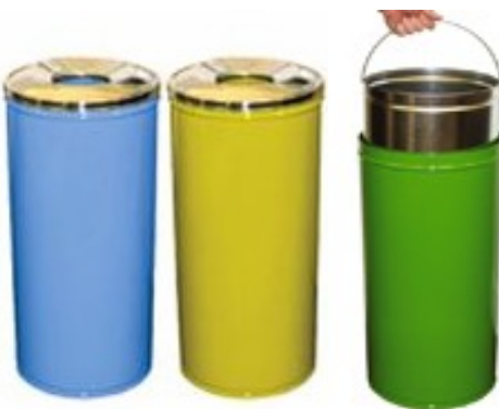
Zintec R with colour coded bodies

Manufactured in powder coated Zintec steel, our Zintec range are ideal for smarter areas where there may be an increased risk of fire. Lids on both the Zintec R are designed to self extinguish any breakout of fire. Colour coding of lids and labelling also allows these bins to be used for recycling schemes or waste separation of flammable materials.