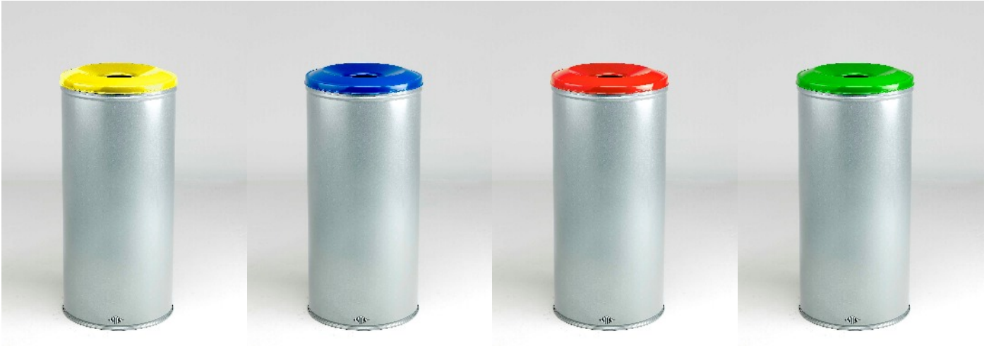
Zintec R with colour coded lids